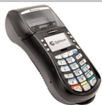
Optimum M4230 (P/N# 010341-002R For EMEA & Asia Region)