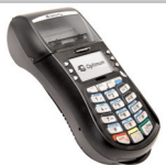
Optimum M4230 (P/N# 010341-001R For North America Region)