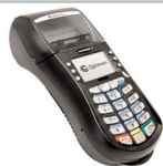
Optimum M4230 (P/N# 010341-007R For North America Region)