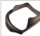
Privacy Shield (P/N# 040348-001)