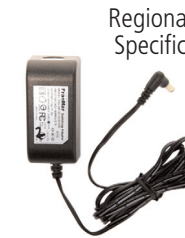
A/C Power Adapter

The Optimum M4230 GSM/GPRS Terminal Installation Guide provides basic setup information. Your device also comes pre-installed with a Lithium Ion Battery Module (7.4V - 1.88Ah). Once fully charged, the battery can complete more than 200 transactions before requiring another charge.