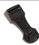
Docking Station with Dial (P/N# VE018-2006)